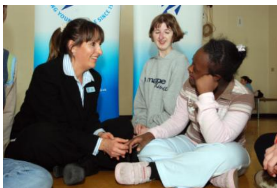
Magpie Dance Cheque Presentation 2009