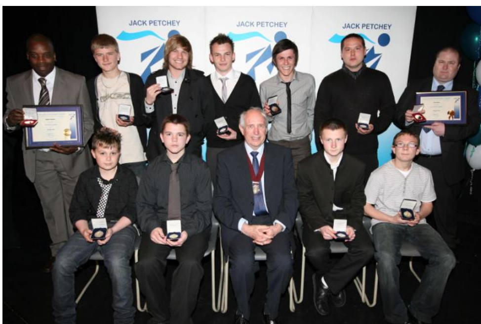
Achievement Award Winners - Essex Regional Awards Presentation 2009

A new small grants scheme for groups operating the Achievement Award programme effectively was introduced in September 2009. 33 applications were received. 15 applications were approved with £7,500 being distributed.