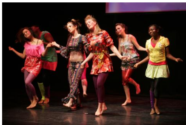
Bexley Schools Awards - July 2009