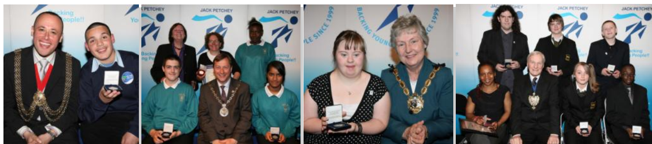
Lambeth, Greenwich, Croydon & Lewisham Awards Presentations 2009

The Statement of Financial Activities includes all gains and losses recognised in the year.