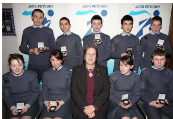
Middlesex Air Cadets Awards - March 2009