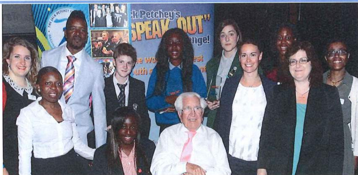
Jack Petchey's SpeakOut Challenge Finalists 2013

Our Individual Grants for Volunteering programme supports young people who wish to volunteer to help others. There were 811 applications received and 583 grants were awarded totaling £126,260 enabling 583 young people to undertake voluntary work both in the UK and abroad.