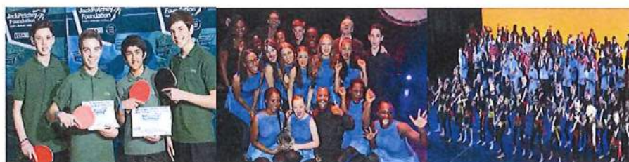
ETTA South London Regional Final 2013, Glee Final at the O2 2013, Step Live 2013,