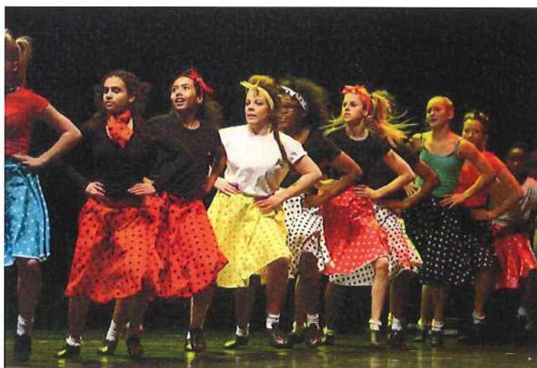
Gateway to Music 2013

The Chief Executive Officer spends approximately 80% of her time supporting the charity's activities and 20% of her time on governance matters.